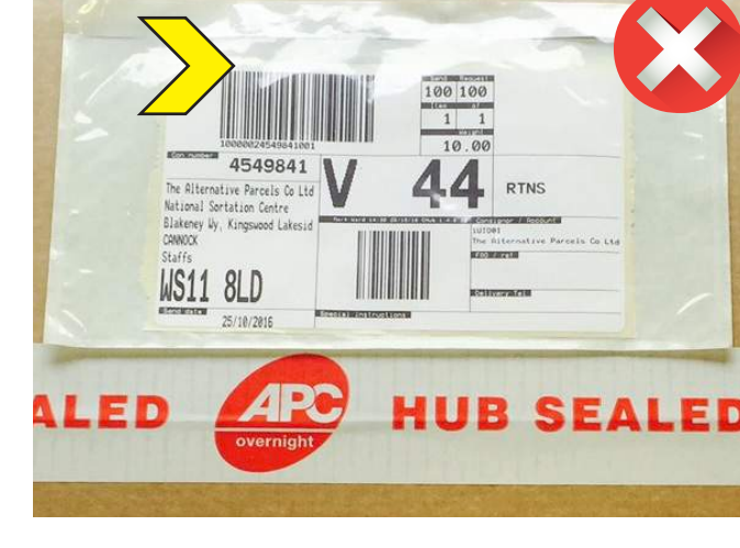
Never place in plastic wallet