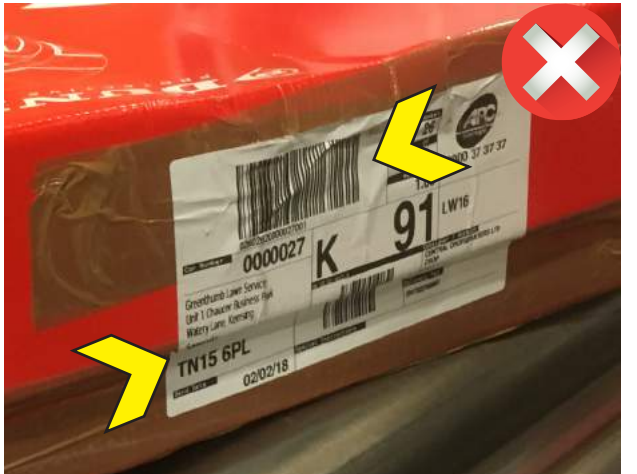
Never crease Never place over flap