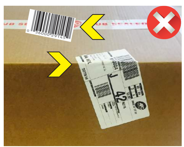
Never place over corners Remove other barcodes