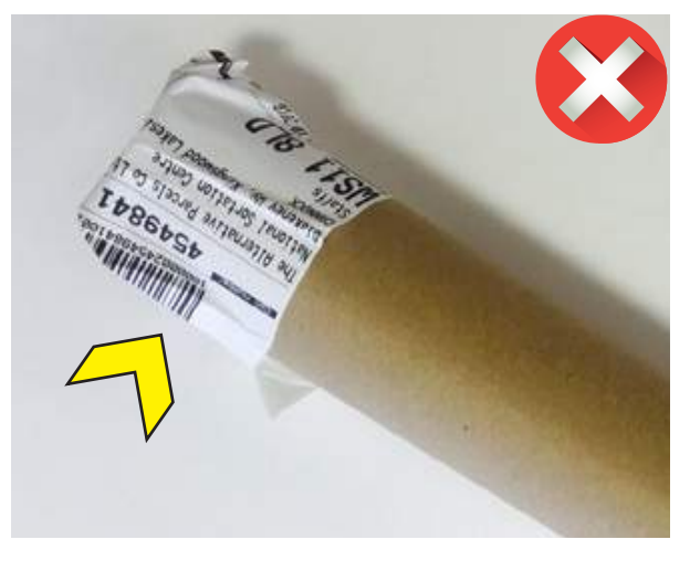
Never scrunch around tube end