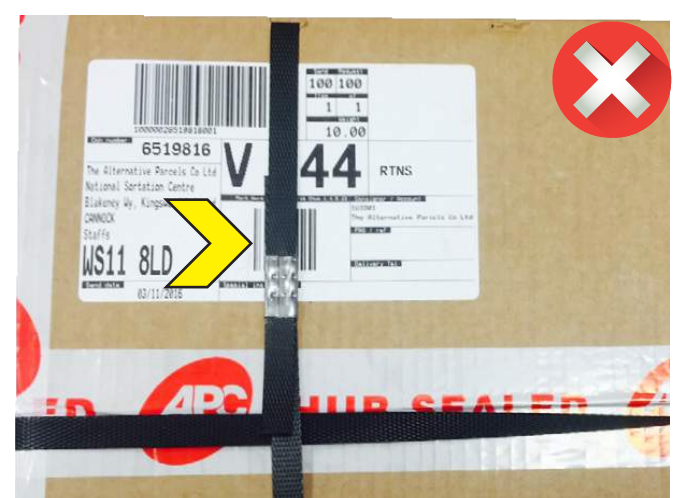
Never cover with strap