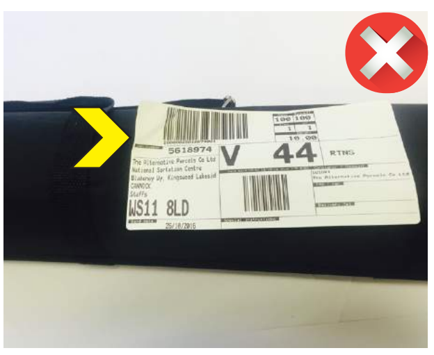
Never place on canvas